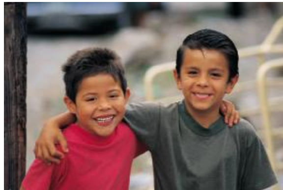
The NC Youth Advocacy and Involvement Office works on behalf of children and youth all across North Carolina.

YAIO seeks to bring about policy and social change for youth by addressing unmet needs through monitoring legislation, policies, programs and special projects. We also collaborate with other state agencies and non-profits to help improve the lives of children and families in North Carolina.